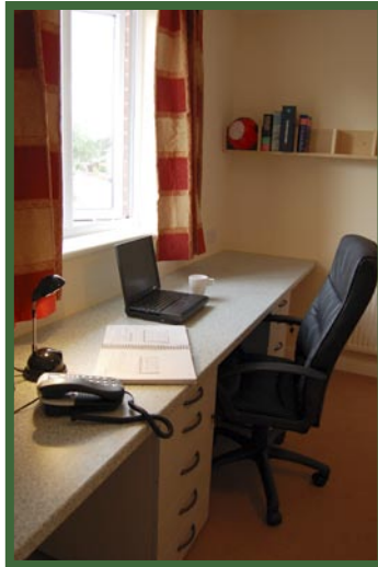
▲ All bedrooms at Rochester Court have workstations with broadband internet access, and ensuite shower rooms.

Satellite Digiboxes are provided in every lounge.