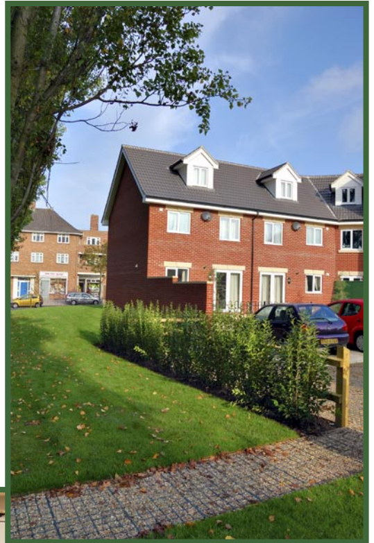
▲ Rochester Court has private off-street parking and landscaped, maintained gardens