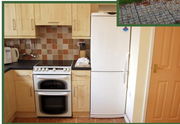
◀ Fully fitted kitchens are equipped with new energy efficient appliances